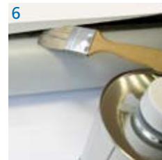
6 Longitudinal seam closed with special solvent-based adhesive