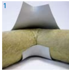
1 Fitting of a premoulded bend

Isogenopak® is fixed along the longitudinal seams either by using plastic push-in rivets in distances of about 150 mm (5) or special solvent-based adhesive continuously along the seams (6).