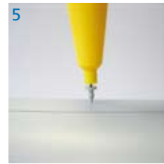
5 Closing longitudinal seams with plastic push-in rivets