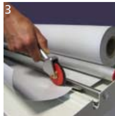
3 Cutting of Isogenopak® with a guide rail